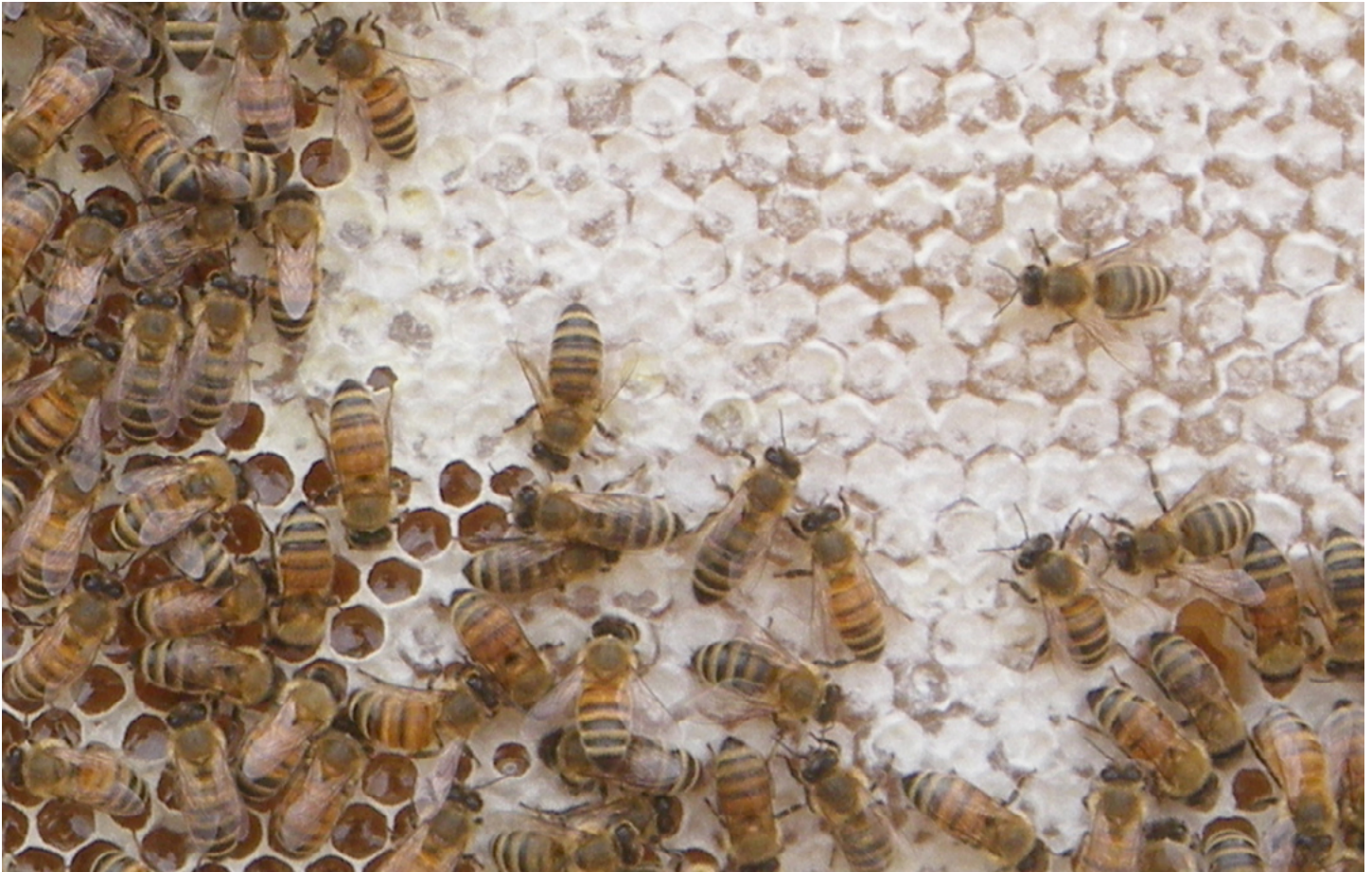
"bees making honey" by Shawn Caza is licensed with CC BY-NC-SA 2.0.

Bees can drink a lot of nectar, as much as their own body weighs. They store the nectar in a special part of their body called a crop, or honey stomach. This is different than the stomach they use to digest food. Bees fly the nectar stored in their honey stomach back to the beehive. Some of this nectar is put into the honeycomb. The bees fan the nectar with their wings to remove extra water and cover it with beeswax. The final product is tasty honey, which many people like to eat!