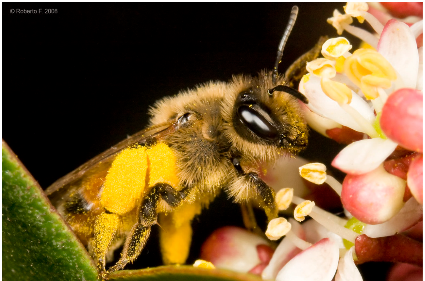
"Overloaded honey bee" by Roberto F. is licensed with CC BY-NC 2.0.

Bees are insects that have a really important job to help fruits and flowers grow. Bees fly from flower to flower drinking nectar. As they drink, pollen from the flower gets stuck to their fuzzy bodies and legs. Bees bring the pollen with them from one flower to the next flower, which helps the flowers grow. Some of these flowers grow into fruit that people like to eat. Bees also take some of the pollen home to their hive to feed baby bees.