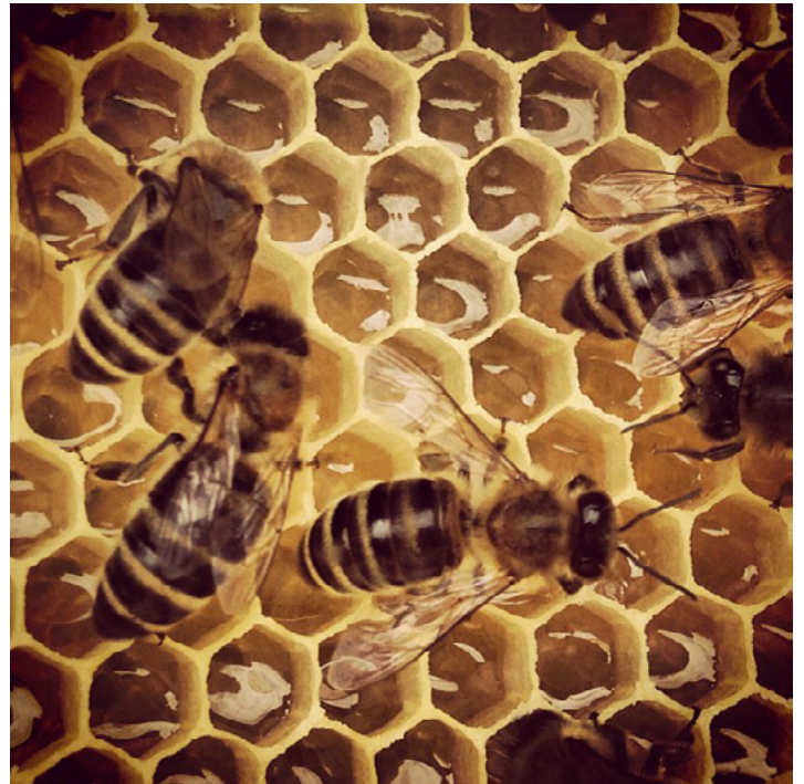
"Observing the 'waggle dance' of bees..." by nashworld is licensed with CC BY-NC-SA 2.0.

The waggle dance starts by bees dancing in a straight line and wagging their tail end. A bigger, more enthusiastic waggle tells other bees there are lots of flowers. Each second of waggle dance tells other bees they will need to fly about a kilometer to reach the flowers. The direction of the straight line tells the bees which way to fly compared to the sun. A waggle dance straight up towards the top of the hive tells bees to fly towards the sun, while a waggle dance towards the bottom of the hive tells bees to fly away from the sun. When a bee has put all of this information into their waggle, they will make a circle to the left and repeat the waggle dance information again.