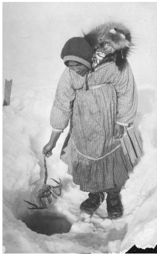
B1970.028.21 Woman with child ice crabbing.