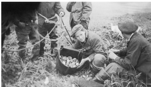
B1996.011.104 Young man holds a basket of collected murre eggs at Pribilof Island.