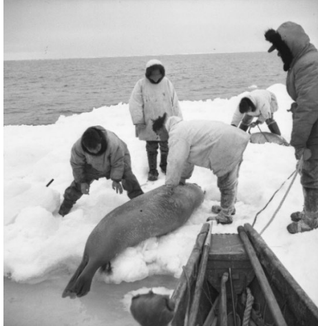
B1990.014.5.AKIndigenous.3.170 Men hunters pulling out a dead seal.