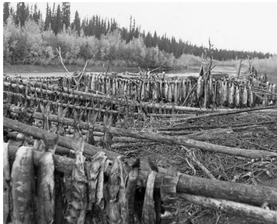
B1985.027.1212 Drying racks with fish in Fort Yukon, AK.