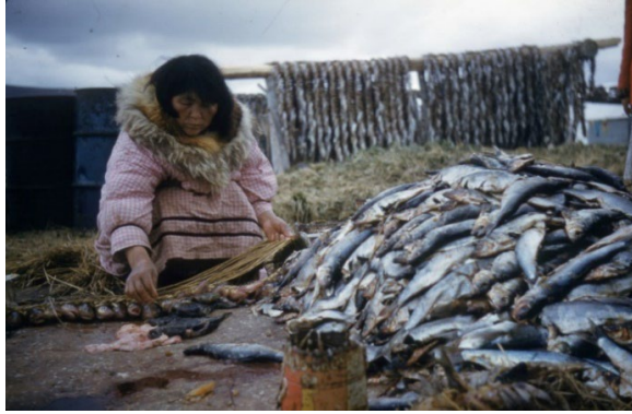
B1991.011.391 Woman braiding herring with rye grass for drying.